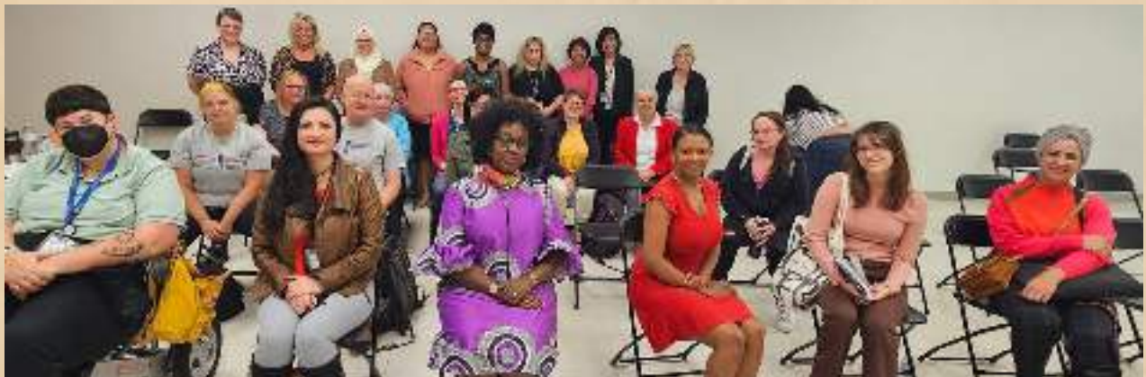
Thank you to our Agency Partners